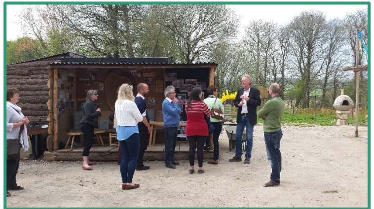
Group visit to the Dartington LandWorks project on Day 2

The event was very much focussed on developing networks and identifying achievable next steps to continue information-sharing and collaboration in the future. The event came to a close after a group visit to Dartington LandWorks – one of the projects that was represented at that the event, which is based on the Dartington Estate.