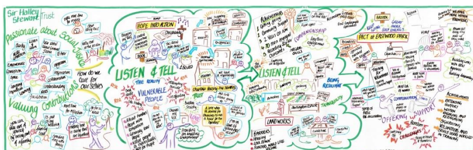
Graphic Recording from the Day 1 sessions

The Trust was delighted with the response and is considering possibilities for future events.